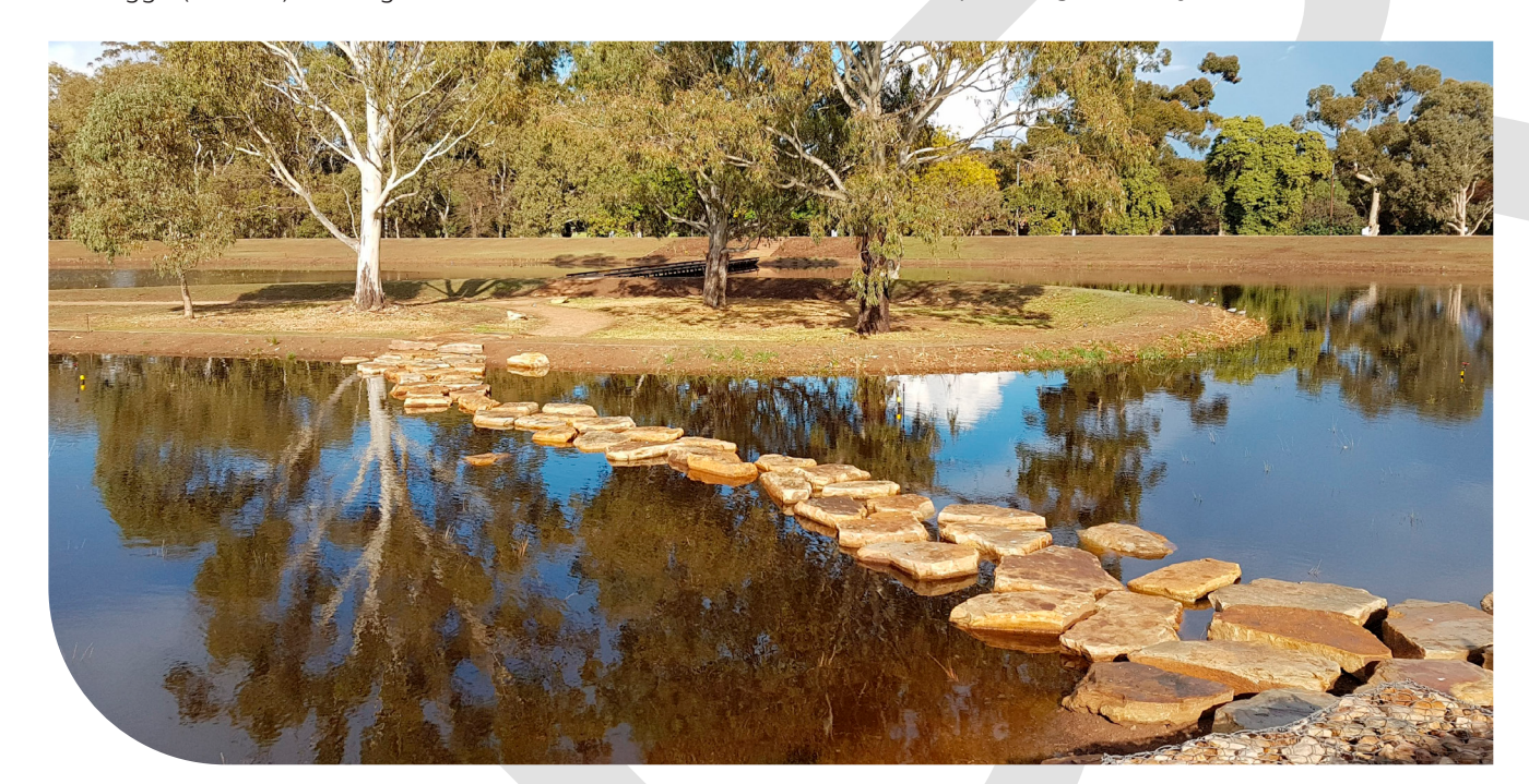
Opening day of the wetlands in Victoria Park/Pakapakanthi (Park 16). Shown here are the steppingstone bridge across the wetlands to a path through a collection of regulated trees and a bridge to the southwestern bank of the wetlands (Beaumont Road is behind the bank).

Kadaltilla has a responsibility to provide advice on policy, development, heritage or management issues affecting the Adelaide Park Lands. This advice can be provided on the basis of any request or on its own initiative. At its meeting in February 2022, in response to a request from Council, Kadaltilla supported the commencement of a Master Plan for Victoria Park/Pakapakanthi (Park 16) to enhance the environmental qualities of the park. Development of the master plan began in May 2022.