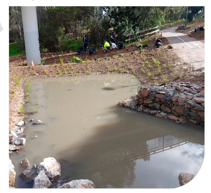
Basin site – looking west. The ephemeral stormwater retention basin with students from Pulteney Grammar School assisting staff with planting local native species. Tree guards from other local native revegetation plantings can be seen in the background. At the project's completion, all the bare/grass ground will be planted with local native species.

City of Adelaide with funding support from Green Adelaide, delivered an urban address and gateway at Hackney Road Bridge. A small 50m2 stormwater retention basin and approximately 1,200m2 of Park Lands was revegetated with over 5,000 local native plants to improve water quality and attract local biodiversity such as woodland birds and native bees. Interpretive signs on Water Sensitive Urban Design have been installed at the basin's edge and a directional sign at the intersection of three paths provides information recognising Kaurna cultural heritage and the River Red Gum Woodland.